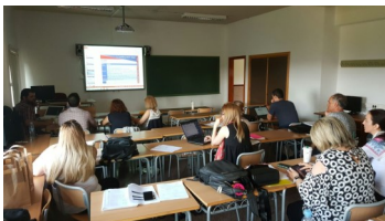
Picture 1: EUPA_NEXT Learning Activity 2 (TRAIN THE MASTER TRAINER) in Spain (May 29-June 2, 2017)

The TRAIN THE MASTER TRAINER workshop (Learning activity 2), organised by MMC, took place in Spain (CIPFP) from 29th of May 2017 to 2nd June 2017 in order to train 4 trainers from the consortium (MMC, ORBIS, CIPFP, DHMHTRA). The TRAIN THE TRAINER BY VET PROVIDERS IN THE CONSORTIUM workshop was held in Spain, Greece, Cyprus, Slovakia and Germany during the period November 2017 to March 2018 and 25 trainers were trained.